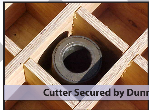
Cutter Secured by Dunnage