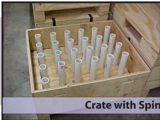
Crate with Spindles

Quick-Crate's collapsible, custom engineered shipping system is designed to protect, transport and store products no matter where you are in the automotive supply chain. Custom built to your specifications, Quick-Crate's internal dunnage can be modified to follow parts through multiple phases of the production process. And removable panels mean parts can be accessed or inspected from the top or any side of the crate.