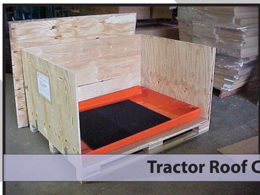
Tractor Roof Crate