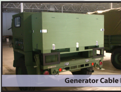
Generator Cable Box

Whether it's ammunition or aircraft components, the Quick-Crate system protects sensitive equipment while meeting supply chain needs and ISPM-15 export regulations. The system has been lab and field tested to the highest standards and is Mil-Std-1660 certified (transportation of live ammunition) by the Army's Defense Ammunition Center. Quick-Crates can stand up to 10,000 psf of pressure and up to 4,000 lbs of load.