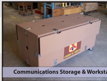
Communications Storage & Workstation