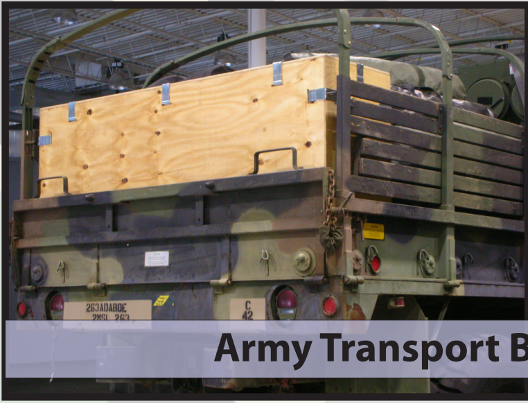
Army Transport Box

Whether it's ammunition or aircraft components, the Quick-Crate system protects sensitive equipment while meeting supply chain needs and ISPM-15 export regulations. The system has been lab and field tested to the highest standards and is Mil-Std-1660 certified (transportation of live ammunition) by the Army's Defense Ammunition Center. Quick-Crates can stand up to 10,000 psf of pressure and up to 4,000 lbs of load.