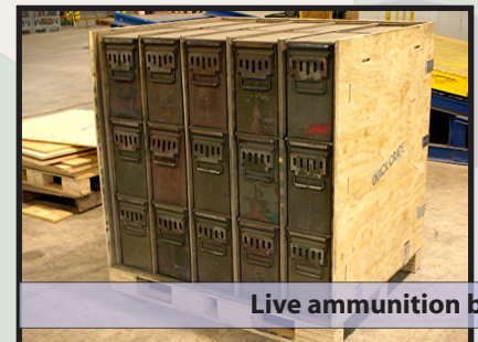
Live ammunition box