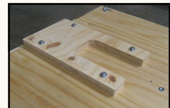
Front tire cradle