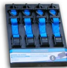
4 tie-down straps